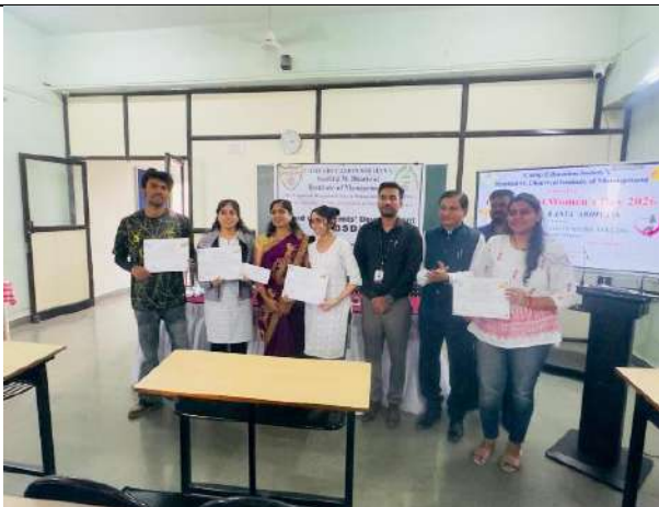
Winner Prize Distribution: Cash Prize along with Certificate