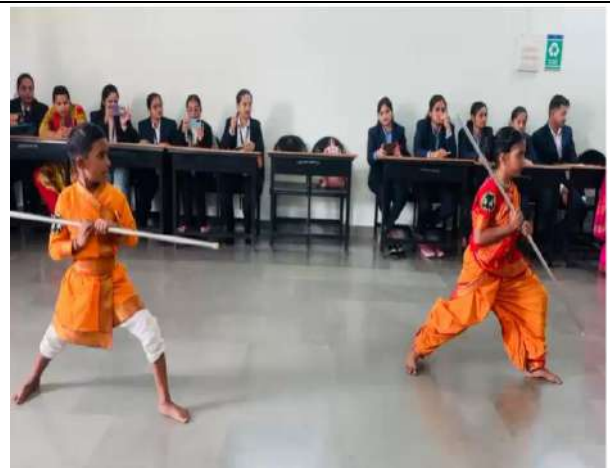
Traditional Lathi-Kathi Martial Arts Demonstration