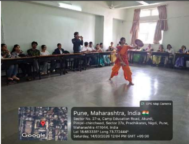
Traditional Lathi-Kathi Martial Arts Demonstration